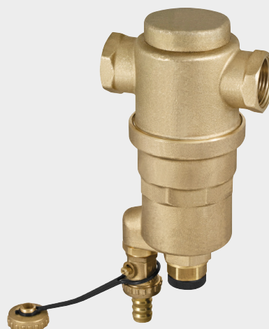
DIRTERM MAG magnetic dirt separator

In addition, RBM Dirterm Mag , is equipped with a powerful magnet to capture rust particles that are formed due to corrosion and scale during the normal operation of a system.