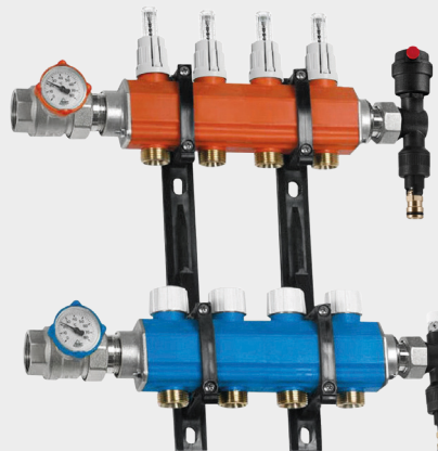
Manifold kits anticondensation