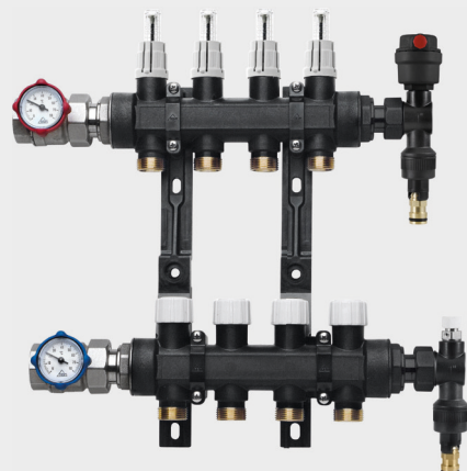
Technopolymer compact manifold kits